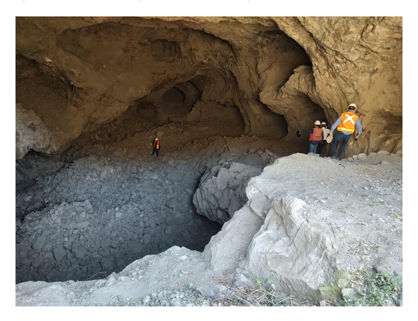
Figure 2: Entrance to historic Mojonera Mine, Plata Verde Project.